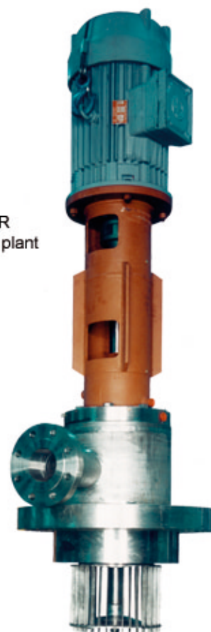
DYNAMIC SEPARATOR used for polypropylene plant