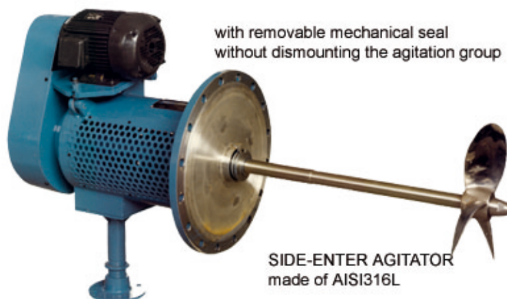
with removable mechanical seal without dismounting the agitation group