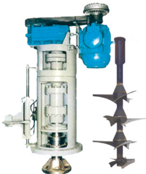
SPECIAL AGITATOR used for gum shaft length: 6500 mm 3 axial flow impellers Ø 2800 mm electric motor: 75 KW with gear reducer spider-shaped mechanical seal